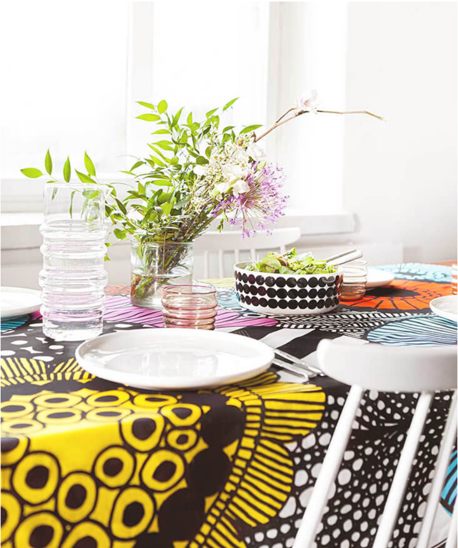
Siirtolapuutarha (city garden) pattern on printed tablecloth by Marimekko's in-